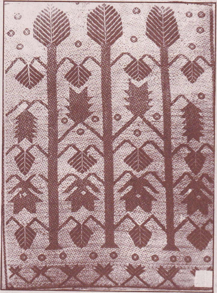
Prayer Mat ( Chuni ), Noakhali