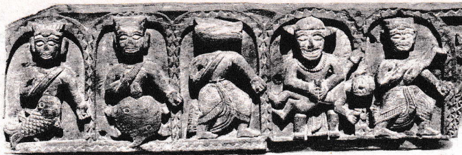
Wood Carving ( Sylhet )

The people of Bangladesh and the outside world will get an opportunity to know the folk tradition of Bangladesh in the Folk Art Museum and Folk Arts and Crafts Village in a rural environment, manifested in the miniature Bangladesh.