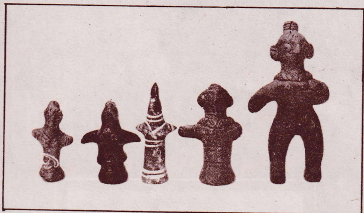
Terra Cotta Doll, Dinajpur, Mymensingh