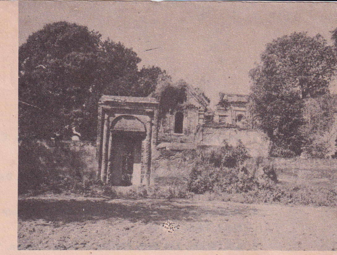
Treasury - Aminpur