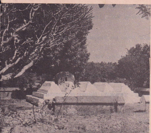
Tomb of Panchpir : Shachilpur