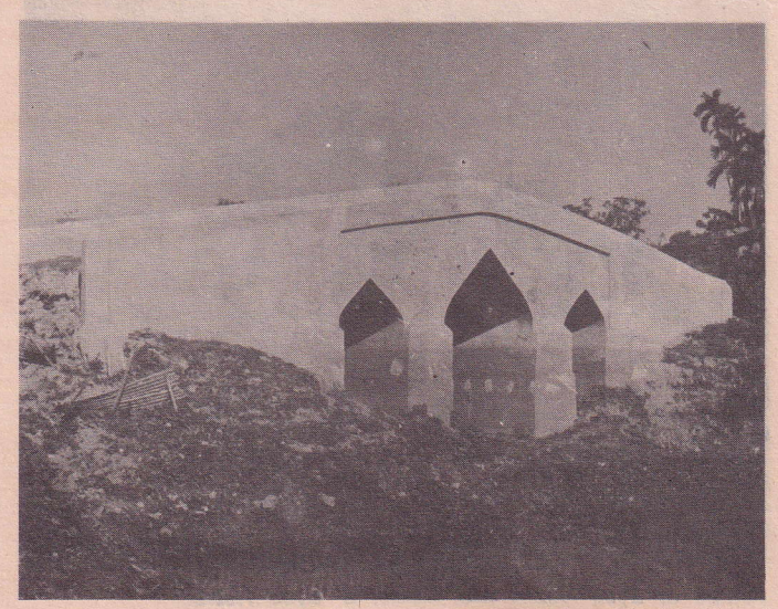
Bridge at Panam (Side View)