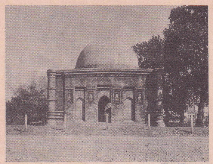
Mosque of Goaldi - 15th Century