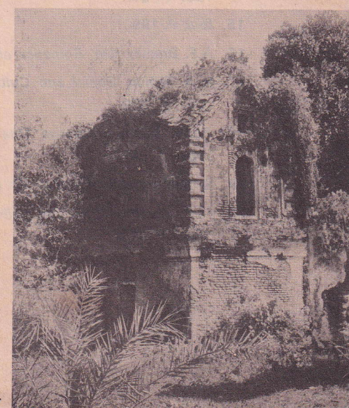
Treasury - Aminpur