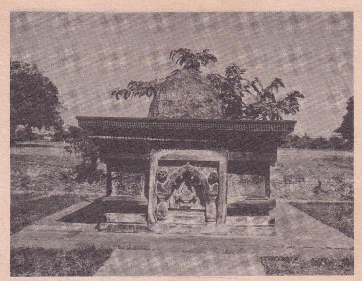
Tomb of Emperor Gyasuddin Azam Shah